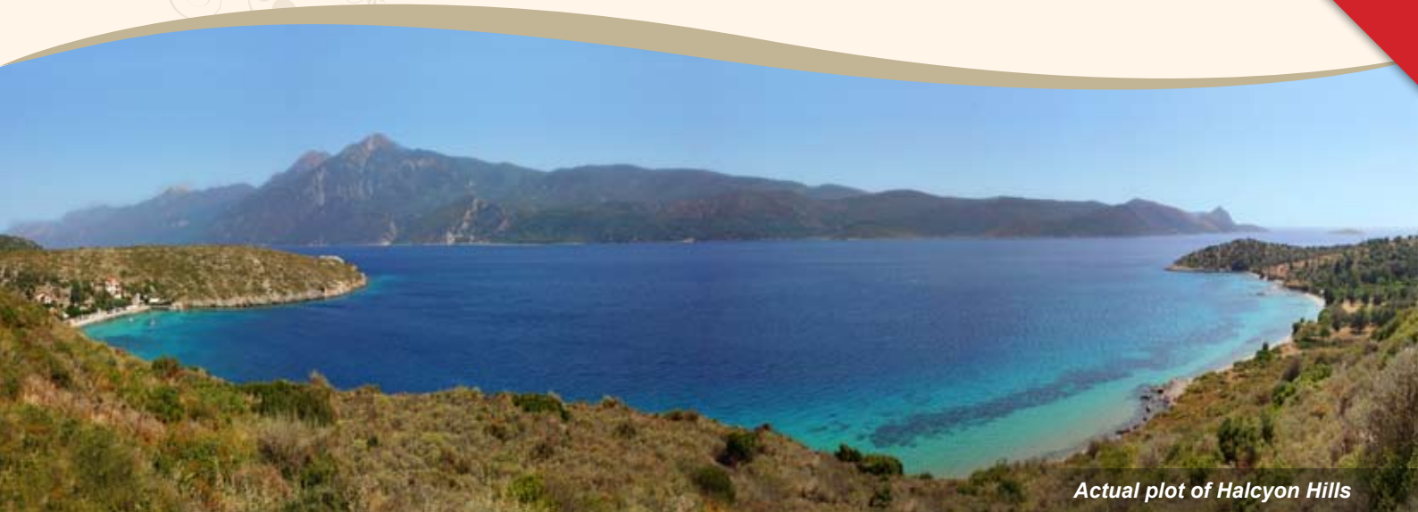
Actual plot of Halcyon Hills

150% BUYBACK GUARANTEE LIMITED AVAILABILITY