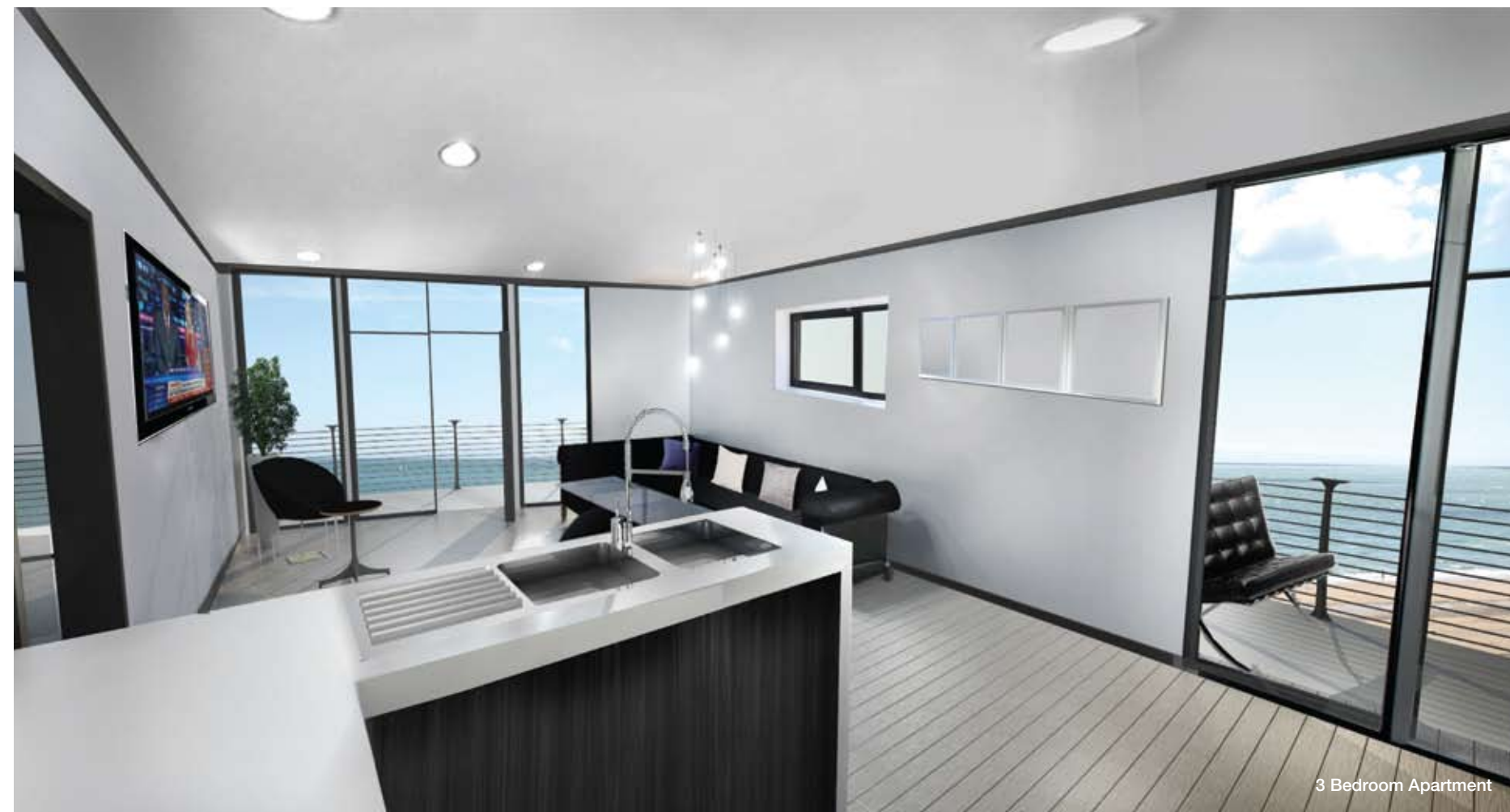
3 Bedroom Apartment

Take advantage of alfresco dining opportunities at the stylish ground floor cafes and restaurants.