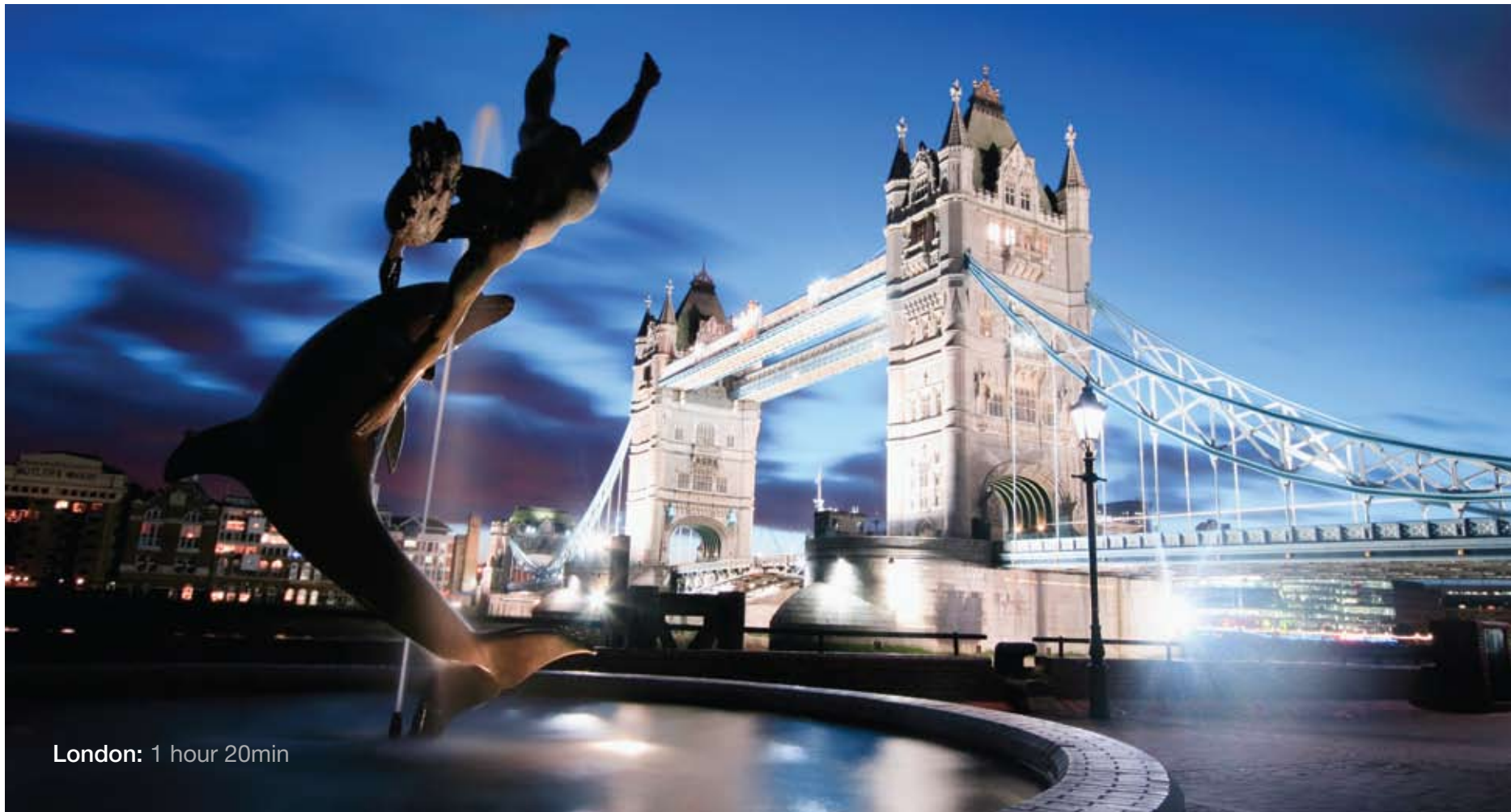
London: 1 hour 20min